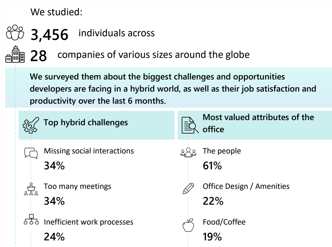
Figure 5: Summary of the research process and results