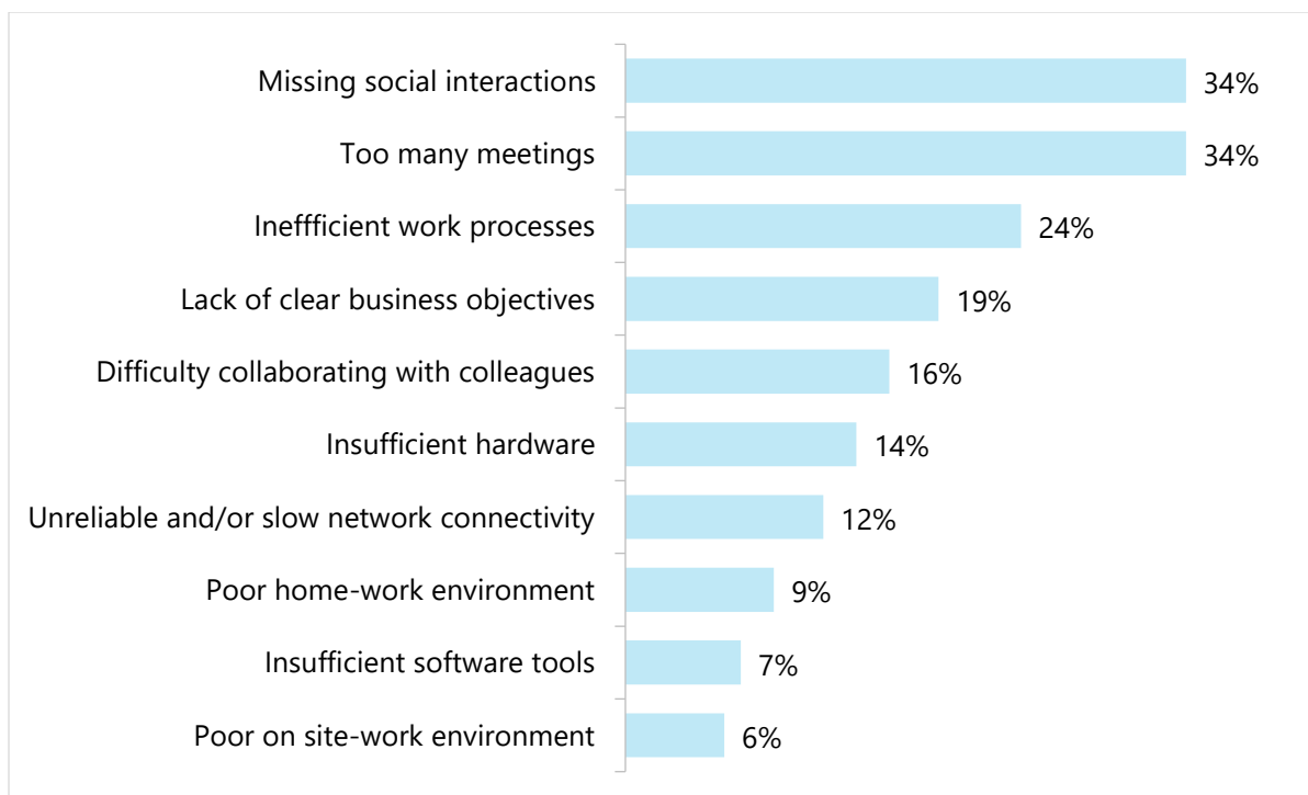
Figure 2: Biggest work challenges reported over last 6 months

To uncover the key challenges facing developers at work, we asked survey respondents, “What have been the biggest work challenges that you have experienced over the last 6 months” and had them select one to three challenges from a pre-determined list compiled from our interviews and from top reported challenges from previous studies 2 . We chose a six-month reflection period because many of the developers in the study use 6-month development cycles, and we did not want to limit the barriers we heard to the activities happening during a subset of the cycle. The below figure shows the challenges listed in order of frequency based on survey responses: