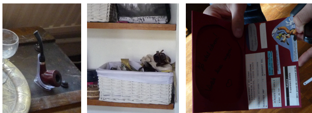
Figure 1. Objects highlighted by participants: a pipe, baskets taken from home, and a photo frame with hidden mementos.

Such objects enable participants to reveal (or choose not to reveal) aspects of their character to new-found friends. In this way they can serve as social vehicles for conveying how identity is bound up with home.