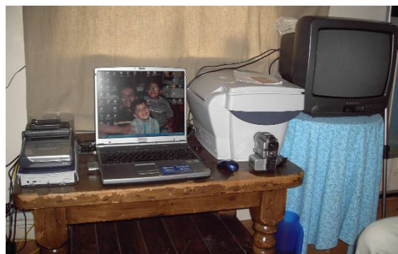
Figure 1. A participant's home video editing suite.

perceptions of the editing process in general. From being shown examples of home videos, discussion naturally moved on to cover what happened with the participants' movies once they had been created, including how they had been archived and stored. In many instances, an exploration of how the resultant video archive was stored within the home helped to elucidate participants' perceptions of their video archive, especially in relation to their home video consumption and sharing behaviours. After discussing what constituted the activities making up the common lifecycle of a video project, from conception to final ‘product’, the participants were asked about perceptions of various suggested advances in video technology to further discuss their motivations in creating home movies.